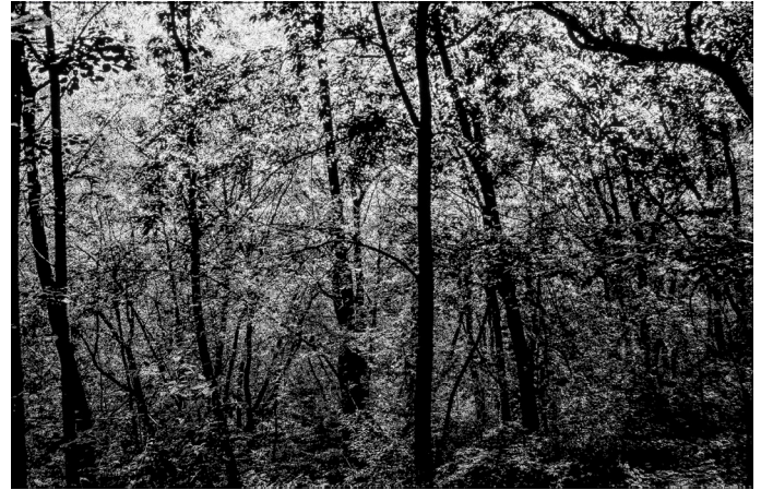
Emptiness – Ansan 02 | 2018 | LED Laminate | 97 x 145.5 x 8 cm (38 x 57 x 3 in)

Daegu MBC, Daegu / Dongseo University, Busan FAWOO Technology, Gyeonggi-do / Galesburg Civic Art Centre, Galesburg, Illinois / I'Park Suwon City Museum, Suwon Jeju Museum of Contemporary Art / Michael Aram, Inc., New York National Museum of Modern and Contemporary Art, Government Art Bank Ocean Hills Country Club, Cheongdo / Seoul Museum of Art, Seoul Targetti Sankey S.P.A., Florence / VOA Associates, Inc., Chicago